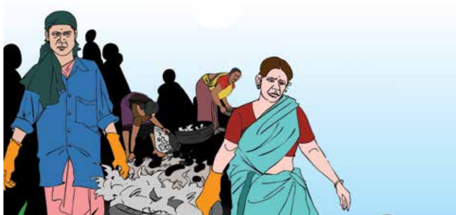
Figure 6.2: Kudumbasree mission in Kerala

Community development relies heavily on local initiative, local involvement and mutual co-operation. For example, the Kudumbasree mission in Kerala (see Figure: 6.2) is a successful example of an area wide project, organized by the Government of Kerala. It relies mainly on local resources and initiatives primarily using the demonstration method of training. The poverty alleviation programme under Kudumbasree has been launched by the Government of Kerala with the active support of Government of India, and National Bank for Agriculture and Rural Development (NABARD) aiming at removing absolute poverty within 10 years with the full cooperation of local self-government institutions (LSGIs). Poverty is a multifaceted state of deprivation and therefore, a multi-pronged strategy alone can hold to eradicate poverty. The programme has 41 lakh members and covers more than 50% of the households in Kerala, which are built around three critical components: micro-credit, microenterprises and women empowerment. Kudumbasree mission initiatives today succeeded in addressing the basic needs of the less privileged women, thus providing them a more dignified life and a better future.