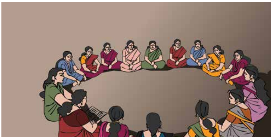
Figure 7.2: A GramaSabha discussing various needs

However, the Sarkaria Commission opposed the above views of the committee. The late Prime Minister Rajiv Gandhi introduced the 64th Constitutional Amendment Bill in 1989. This bill was defeated in the Rajyasabha. Then the National Front introduced the 74th Constitutional Amendment Bill. It could not become an Act because of the dissolution of the 9th Lok Sabha. All these suggestions and recommendations were considered later, while formulating the new constitutional Amendment Act. The powers and functions vested in Panchayat Raj Institutions vary from state to state.