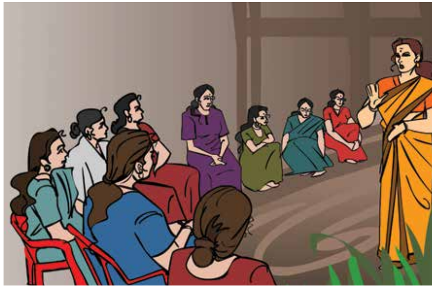
Figure: 6.1. Gramasabha meeting

In 1957, five years after the launching of the Community Development programme, the Government appointed the Balvantrai Mehta Committee to suggest measures to remove obstacles in implementing the programme. The Committee recommended the formation of a three-tier-system of rural local Government, to be called, 'Panchayati Raj' (Rule by Local Councils). These were Grama Panchayat (Village level), Panchayat Samiti (Block level) and Zilla Parishad (District level). The aim was to decentralize the process of decision making and to shift the decision making centre closer to the people. The system was intended to encourage people's participation and place the bureaucracy under their local control. The picture below shows the Grama sabha meeting which is an example of decentralisation of power (Figure: 6.1)